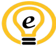
eDoctrina® Better Data. Better Students.