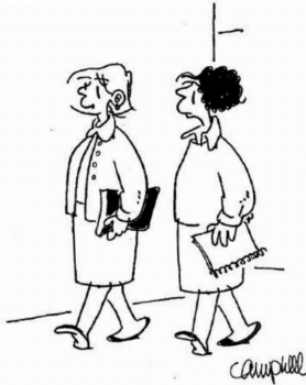
"My goal for tonight is purposeless, ambiguous, immeasurable, unaccounted-for TV viewing for as long as I feel like it. I think that's attainable."

also be able to fluently solve one and two step word problems, involving addition and subtraction within 20, with 80 percent accuracy. These goals will be achieved by efficiently teaching the curriculum and providing whole group, small group and individual lessons. We will track their progress by monitoring student understanding and achievement through CFAs, Rocket Math, anecdotal records, and informal assessments. These are relevant goals because they are part of the core standards.